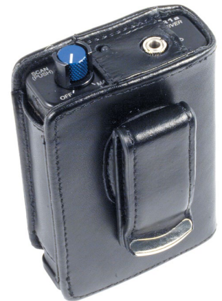
The R1a comes with a protective leather pouch with an integrated belt clip.

The incoming RF signal is filtered and amplified, then mixed down to the IF frequency with a microprocessor controlled synthesizer. A pilot tone squelch system is used to keep the receiver silent when no carrier is present. The pilot tone signal is on a different frequency than Lectrosonics UHF wireless microphone systems to prevent interference when the systems are used in the same location. The audio signal processing includes compressor noise reduction for low noise and excellent intelligibility.