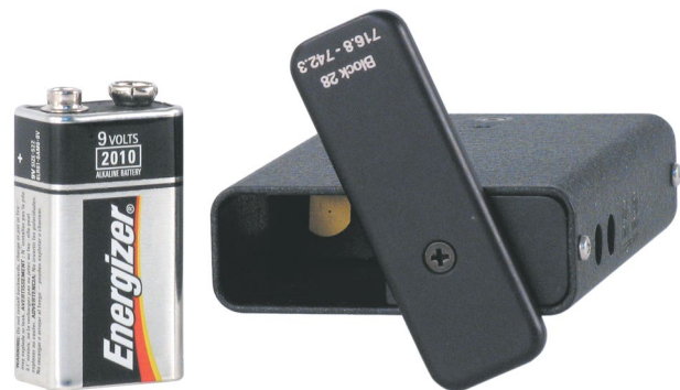
An attached rotating door makes battery installation easy.

The receiver is housed in a compact machined aluminum enclosure. The unit features an integral rotating battery door that remains attached to the housing when opened. All nomenclature is laser engraved into the housing to withstand physical abrasion and heavy use. A condensed instruction set is also laser etched into the side panel of the receiver.