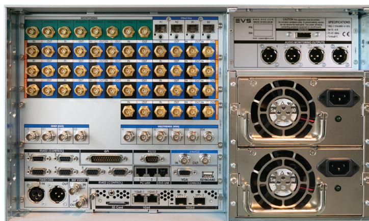
XT-VIA (Standard Backplane) 3G & 12G-SDI Connectors